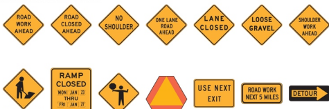
FLAGMAN AHEAD SLOW MOVING VEHICLE